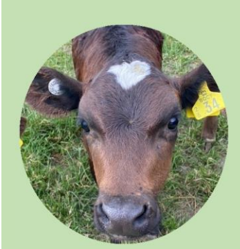
Next Farm Walk